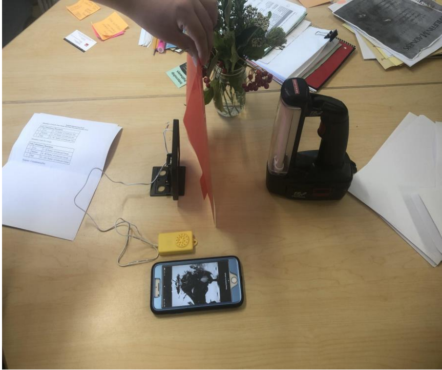
Figure 3: Shows how the door bell is positioned with the phone that has the decibel app