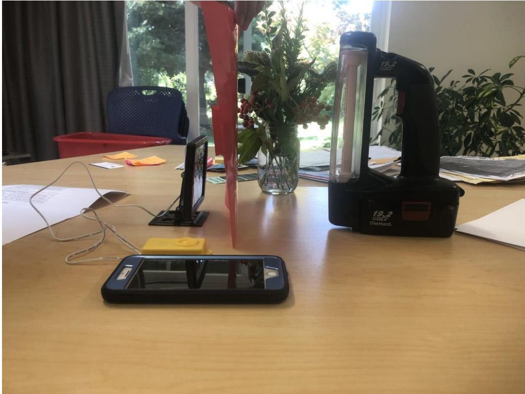
Figure 1: Shows the approximate distance the flashlight and solar panel should be.